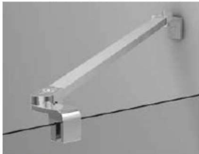
GLASS 5 mm Vetro 5 mm Verre 5 mm