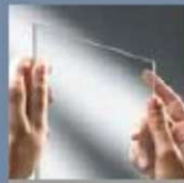
Clear Trasparente Transparent